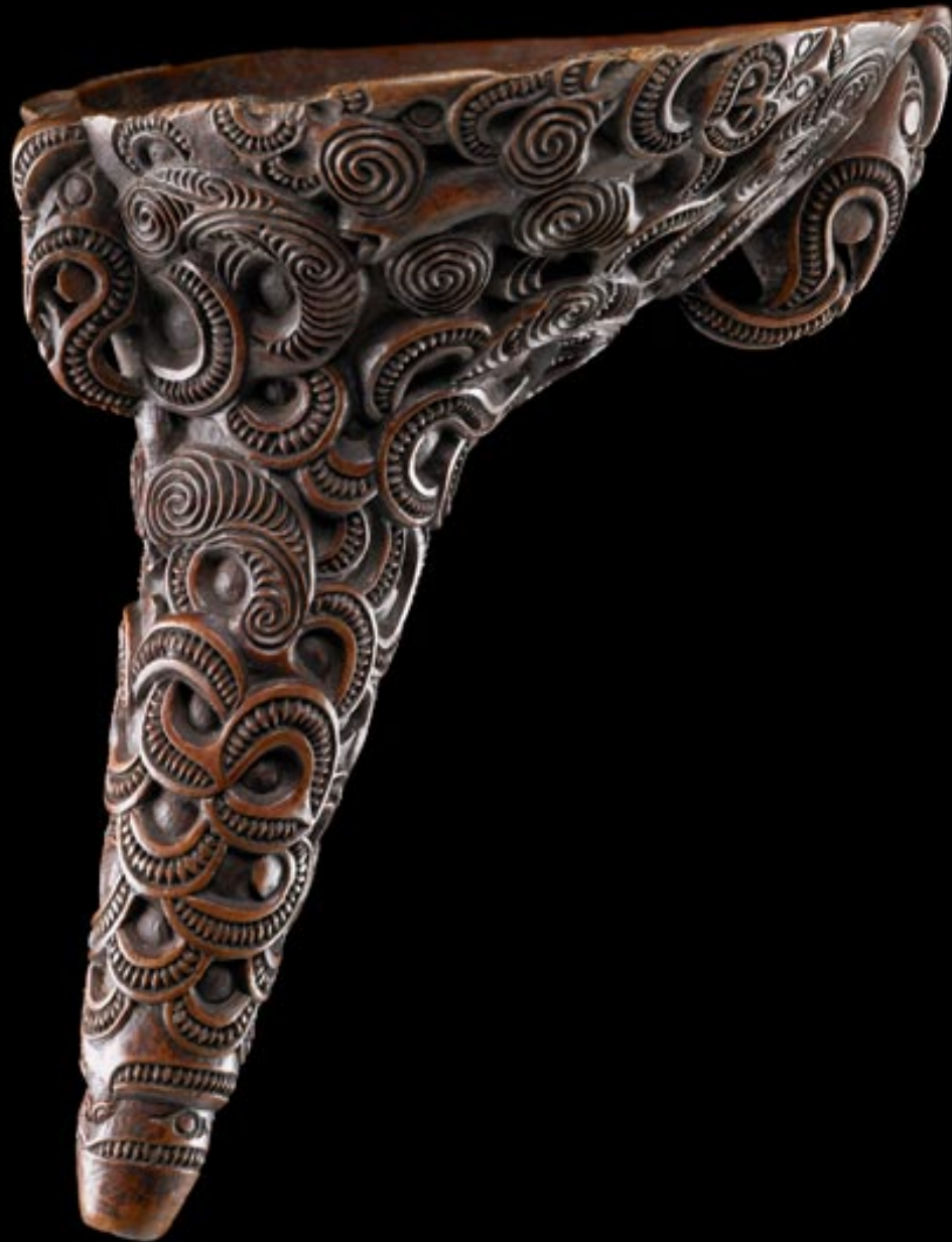
18 th century Maori carved feeding funnel