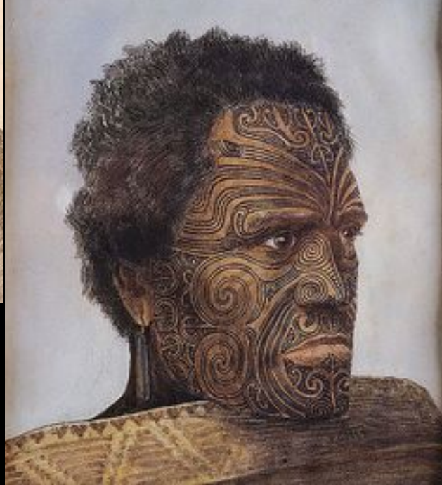
Historic Ta Moko